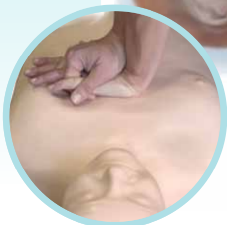
ADULT: Position hands middle of chest